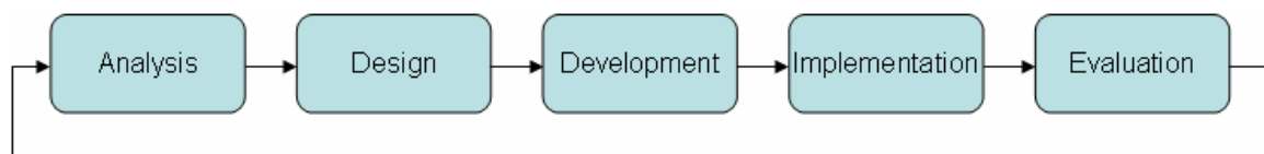
Figure 1 - Classic ADDIE model

According to Botturi & al (2007), Classic instructional design models, starting from ADDIE (figure 1), up to ASSURE and the Dick, Carey & Carey model, take a linear perspective: they describe the ID process as a structured and orderly step-by-step activity, characterized by a progressive advancement through Analysis, Design, Development, Implementation and Evaluation; the process also includes a cycle of revision for each edition or delivery of the training.